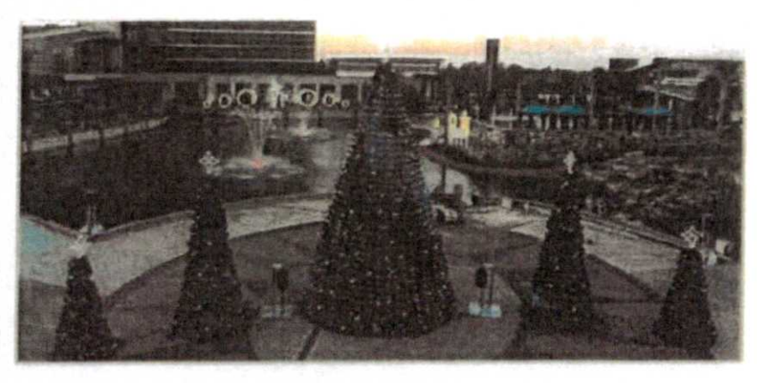
Priced with LED C7 Lights, LED Star Topper, and our traditional ornament package. Affordable and easy to install!